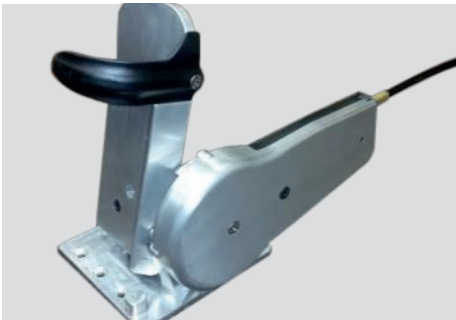
CABLE ROUTE TO FRONT