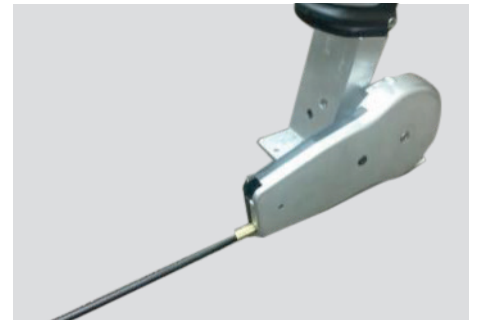
CABLE ROUTE TO BACK