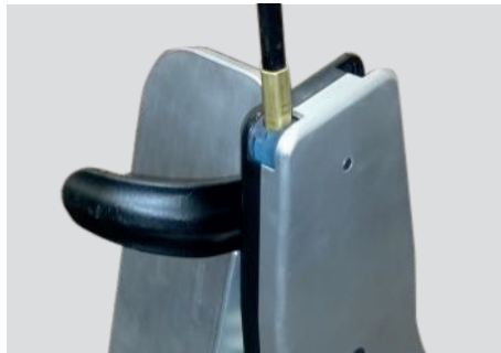
CABLE ROUTE UP TO CONSOLE